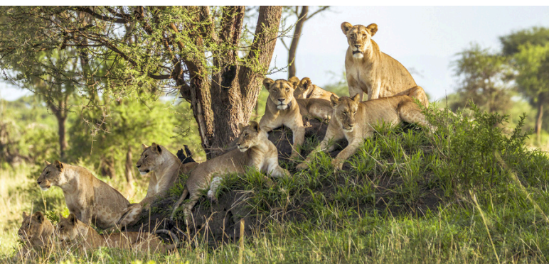
Resident Lion Prides