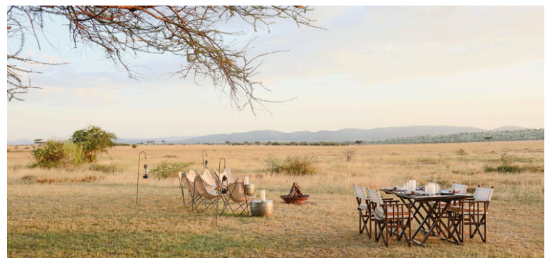
Al Fresco Dining