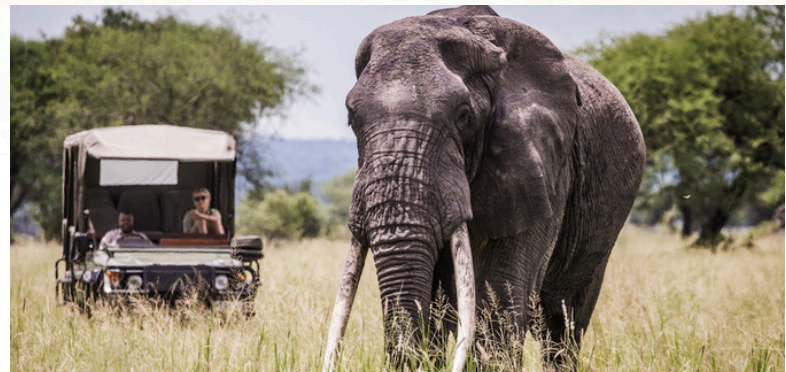
Big Tusker Encounters